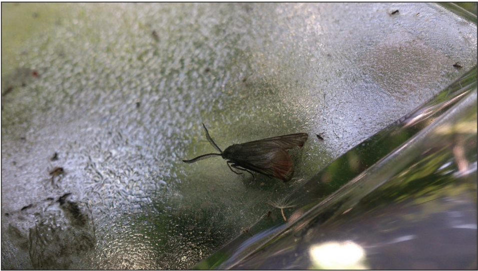
Figure 2. – Attracted male of I. (P.) pruni on sticky layer in trap baited with EFETOV-S-2.

In 2014, EFETOV-2 did not attract the males of I. (P.) pruni either. However, the males of this species were caught in traps baited with EFETOV-S-2 in 2016 (Fig. 2). It should be noted that neither I. (P.) pruni larvae nor cocoons were found in studied sites.