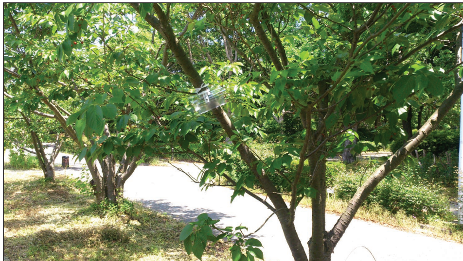
Figure 1. – Delta trap with attractant EFETOV-S-2 (Campus, 2016).

For preparing lures, attractants were applied onto vial caps composed of grey rubber. The baits were fixed in home-made transparent Delta traps with removable sticky layers (10 cm x 15 cm) covered with insect glue (the Tanglefoot Company, Grand Rapids, Michigan, USA). In all sites that were investigated we also placed control traps without attractant rubber caps (negative control). The traps were hung on trees at a height of 1.0–1.5 m above the ground (Fig. 1).