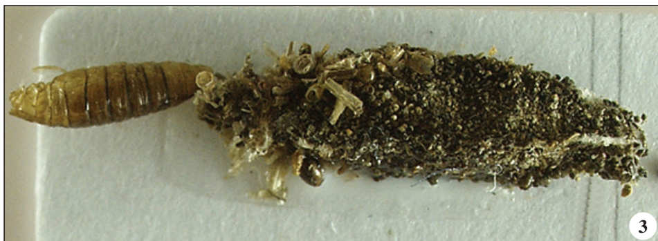
Figs. 1-3. — 1-2. Dahlica lichenella (Linnaeus, 1761). 1. Female, 2. Larval case, 3. Dahlica triquetrella (Hübner, [1813]). Larval case.