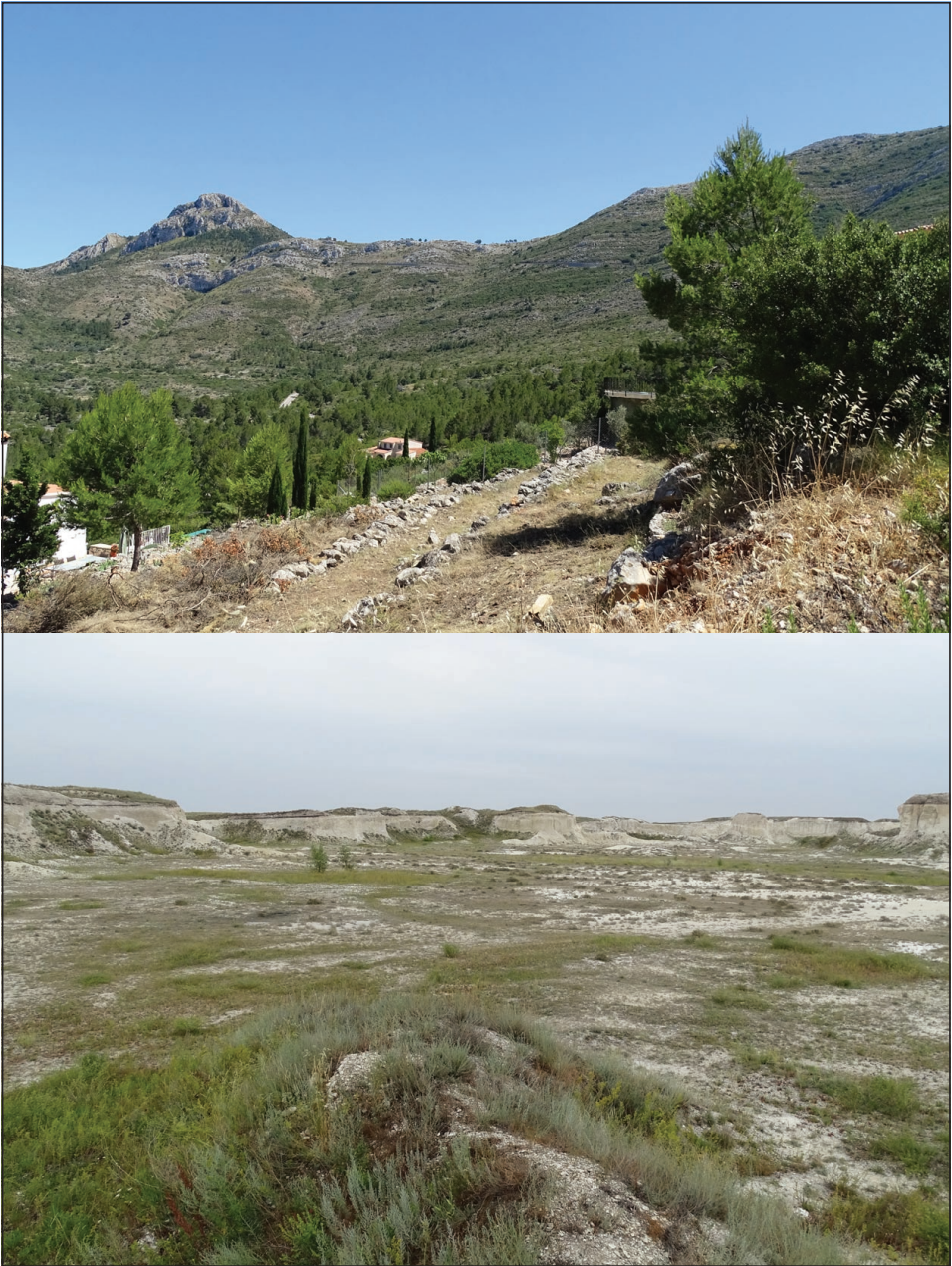
Figs. 5-6. — 5. Habitat of Scythris spiniferella Nupponen & Savenkov, sp. n. in Parcent, prov. Alicante, Spain. (Photo: N. Savenkov). 6. Chalk steppe in Akbulak, Southern Urals, Russia: habitat of Scythris rowecki Nupponen & Savenkov, sp. n. (Photo: N. Savenkov).