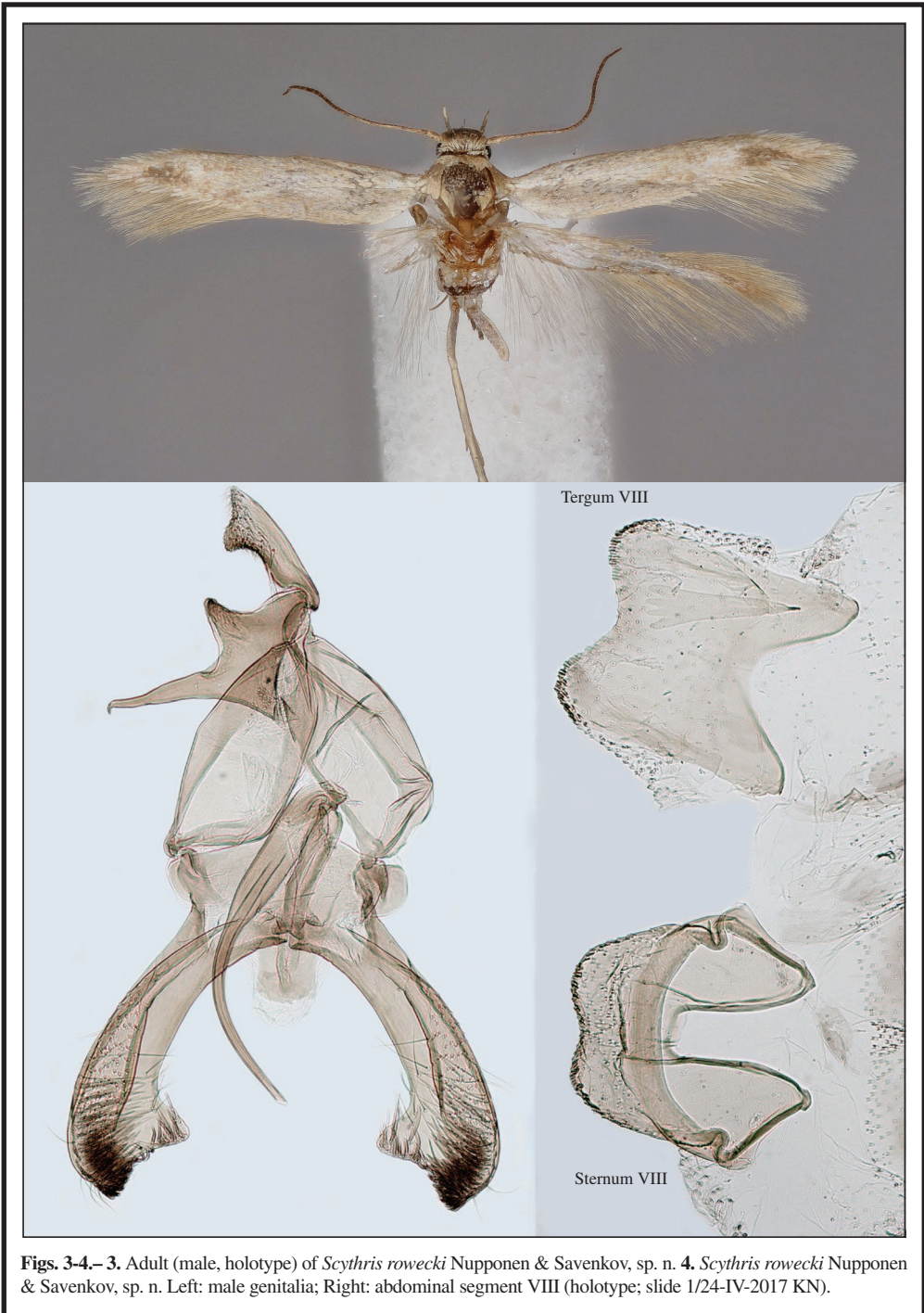
Figs. 3-4. — 3. Adult (male, holotype) of Scythris roweckii Nupponen & Savenkov, sp. n. 4. Scythris roweckii Nupponen & Savenkov, sp. n. Left: male genitalia; Right: abdominal segment VIII (holotype; slide 1/24-IV-2017 KN).