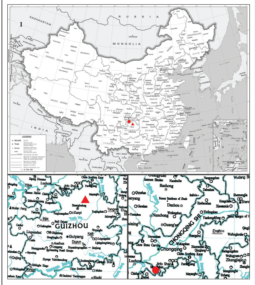
Fig 1.- Distribution map of Rh. (Reticularisus) shierbeihoua Wu, Wu & Han, sp. n.: Guizhou Province (triangle) and Chongqing Municipality (circle), China.

Etymology: The species is named for its type-locality in Shierbeihou scenic spots, Zunyi City, Guizhou Province, China.