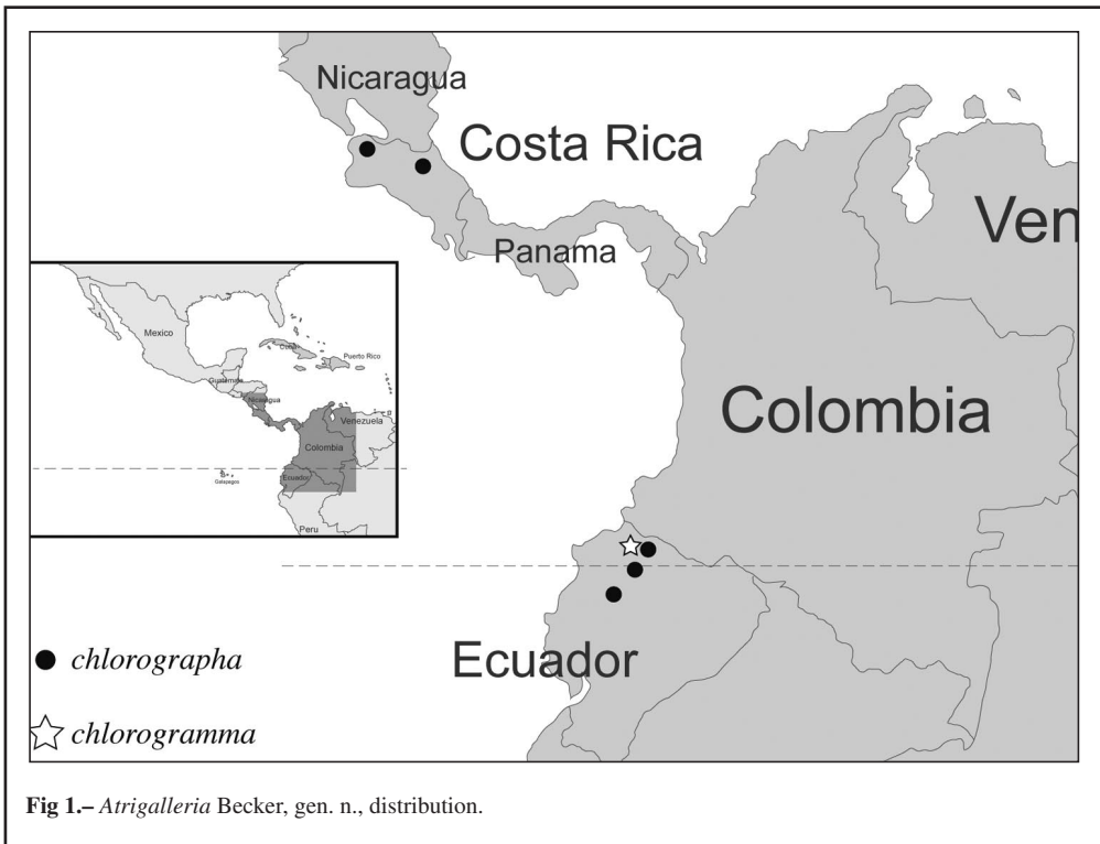
Fig 1.- Atrigalleria Becker, gen. n., distribution.

Distribution (fig. 1): Ecuador, Costa Rica, at mid to high elevations.