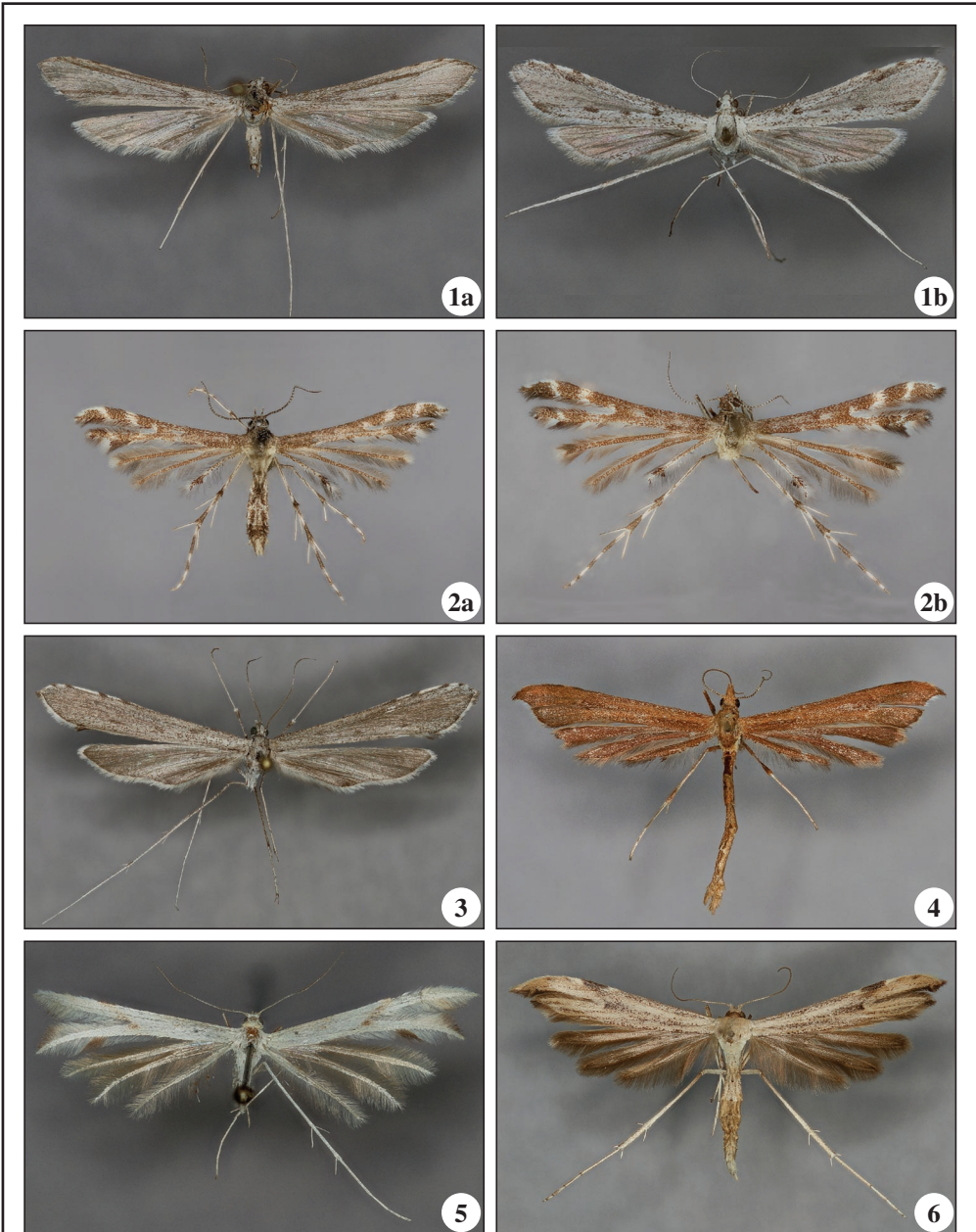
Figs 1-6. — Adults of 1. Agdistis kazakhstanicus Ustjuzhanin, 2014. 1a. male. 1b. female. 2. Procapperia processidactyla Nupponen, sp. n. 2a. male, holotype. 2b. female, paratype. 3. Agdistis flavissima (Caradja, 1920) (Russia, Astrakhan district). 4. Gillmeria stenoptiloides (Filipjev, 1927) (Russia, North Ural). 5. Tabulaephorus maracandicus Arenberger, 1998 (Uzbekistan). 6. Oidaematophorus constanti (Ragonot, 1875) (Ural).