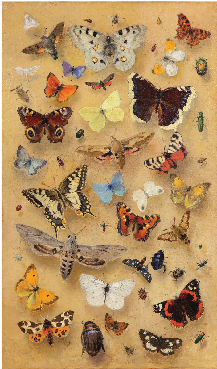
Figure 1. A painting by Vasily D. Polenov entitled “Babochki” [Lepidoptera] (1870s) from the Museum Estate of Vasily Polenov, Polenovo (Tula Region, Russia).